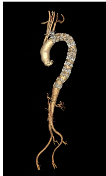
Fig. 3 – Exclusion of affected part of thoracic aorta by three tubular stent grafts.

volume of the left atrium of heart appears, the clinical manifestation is similar to cardiac tamponade. In this case, the patient could be hemodynamically stabilized by the fast refilling of the intravascular volume with pre-existing dehydration, which resulted in the improvement of the refilling of heart compartments with a relative re-